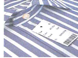
APPAREL TAG AND LABEL